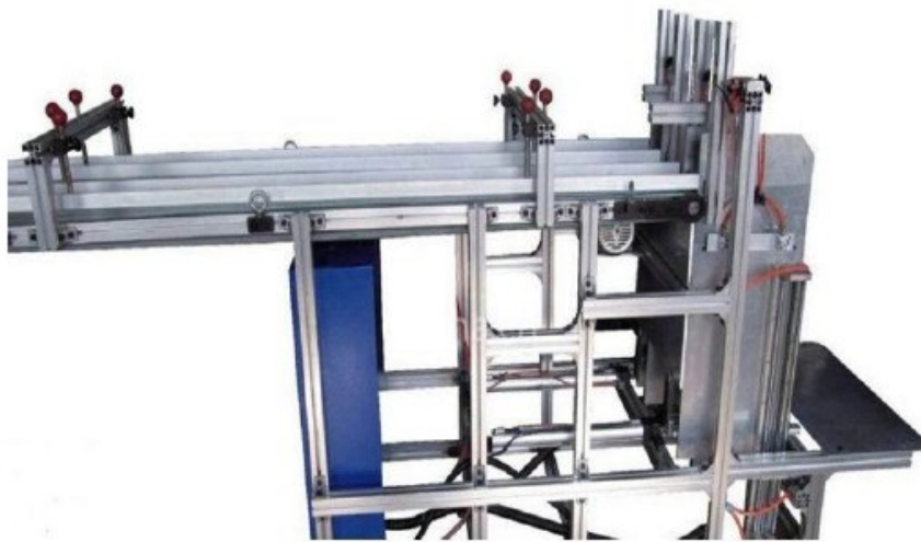
The Automatic Stacker