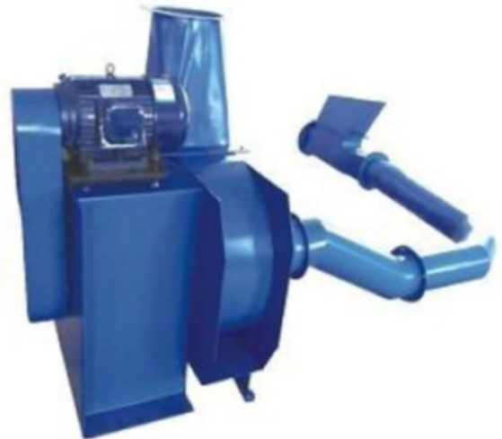
The Scrap Collector