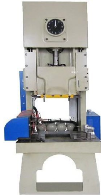
The 110 T Press Machine