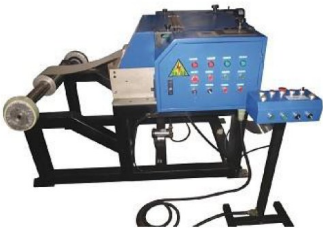
The Feeding Machine With Lubricated Oil System